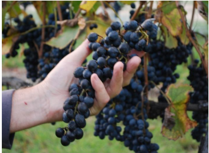
The Shiraz grapes used to make our 2017 Shiraz

When we make our red wines (e.g., using Shiraz grapes) the grapes are put through a crusher-destemmer machine which gently removes the grapes from the bunch stem and then lightly crushes them so that the skin splits. We then transfer the resulting mix of juice, skins and seeds (known as must ) into a tank where we add yeast and ferment the must for approx. 7-10 days until all sugars are converted into alcohol. The dry tannins and dark colour typical of a red wine is derived from this extended contact with the skins. When the ferment is finished we then transfer the fermented must into a press where the skins and seeds are removed and taken to our mulch heap for composting. The wine is then matured for approx. 12-14 months before being fined, filtered and bottled.