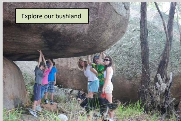
Explore our bushland