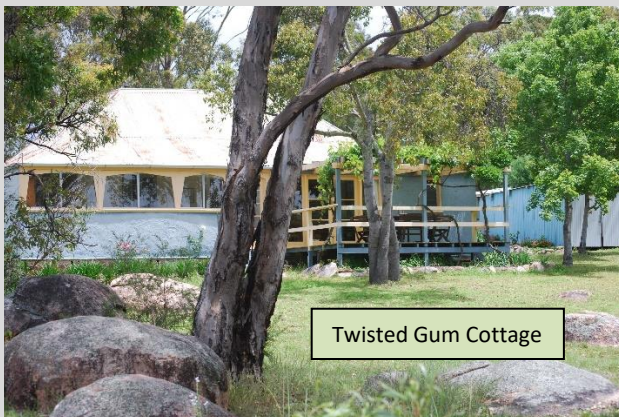
Twisted Gum Cottage

To celebrate the arrival of this beautiful weather in the Granite Belt we have decided to create a special Cool Summer Promotion for Twisted Gum Cottage, where if you stay for two nights the third night is free! You can enjoy a fabulous cool summer escape in Twisted Gum Cottage, surrounded by lush green vineyards and rugged native forest. Our vineyard is located at an altitude of 900 metres at one of the highest points in spectacular Granite Belt Wine Country, where summer days are sunny and mild and the nights are cool and crisp. You can explore the 30+ award winning cellar doors and boutique olive groves, cheese producers, restaurants, fresh fruit and vegetable stalls and the breathtaking Girraween National Park. Or you could simply sit on the deck with a glass of wine and enjoy the peace and quiet. ☺