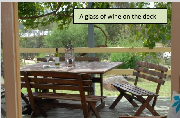
A glass of wine on the deck